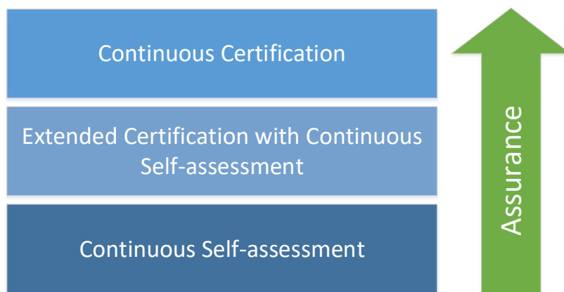
Figure 1 Assurance

EU-SEC's continuous auditing changes the nature of auditing from a traditional, process-driven, point-in-time certification towards a data-driven real-time certification . A certification based on more frequent assessment of controls is particularly in demand by cloud customers with sensitive data, such as financial institutions or companies in the health sector. Currently, they cannot obtain an up-to-date verification that their data is subject to good practice by CSPs. By applying continuous certification, the level of trust, transparency and assurance is greatly improved.